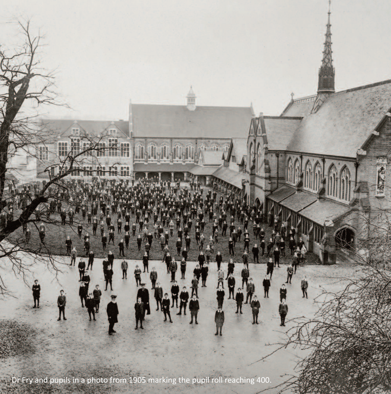
Dr Fry and pupils in a photo from 1905 marking the pupil roll reaching 400.