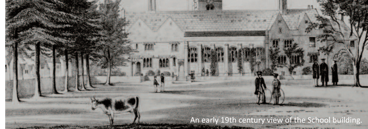
An early 19th century view of the School building.